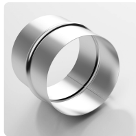
Hose connector Sheet steel connector for extending, connecting and joining light to medium-weight hoses