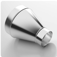
Hose Reducer, symmetrical Hose reducer for extending, connecting and joining light to medium weight hoses