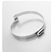
Master-Grip Hose Clamp, screwable Special clamp for fastening light and medium-weight, right-handed spiral hoses such as Flamex B-se, Flamex B-F se, Master-PUR Trivolution, Master-PVC and Master-SANTO