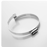
Clip-Grip Hose Clamp, screwable Screwable clamp for attaching all hose types from the Master-Clip series to mobile and stationary systems